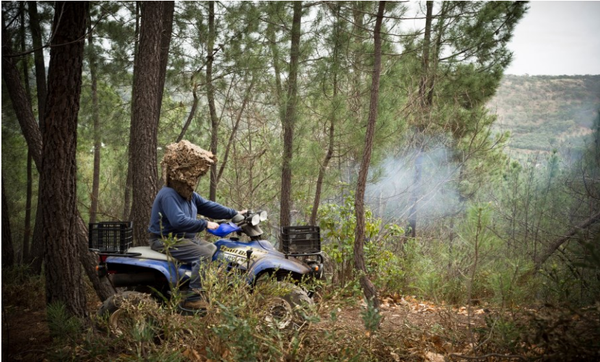
Ana Matey art@photo